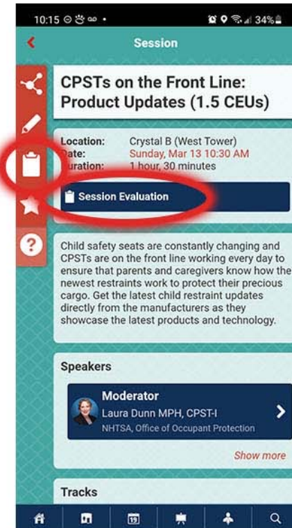
CLICK SESSION EVALUATION BUTTON (OR) CLIPBOARD ICON