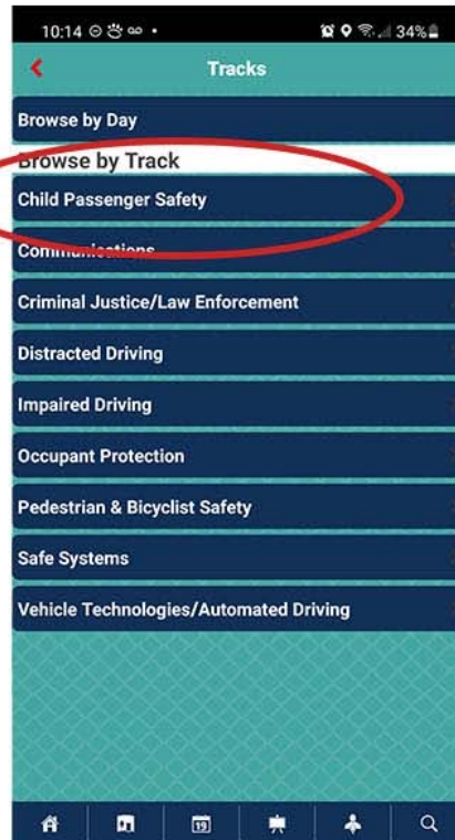
SELECT APPLICABLE TRACK