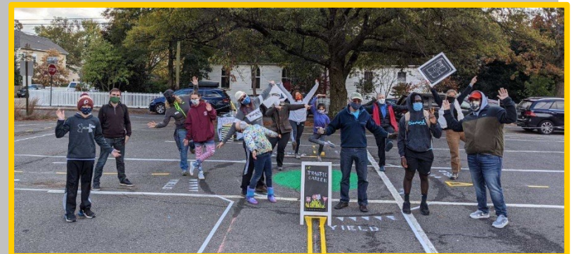
Traffic Garden Installation / October 31, 2020