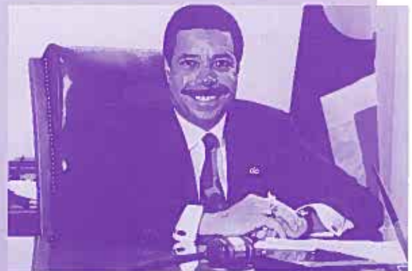
Wellington E. Webb Mayor