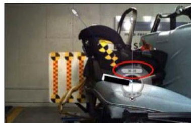
seat at full rotation, still at 36.28° from vertical

measured 0° of total rotational movement