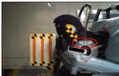
test starting angle 36.28° from vertical

Nuna PIPA rear facing car seat with a stability (load) leg