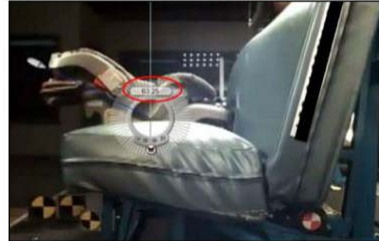
seat at full rotation, just over 63° from vertical